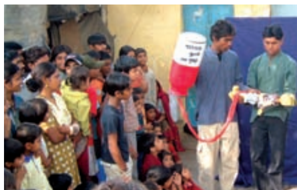
© The Ishara Puppet Theatre Trust