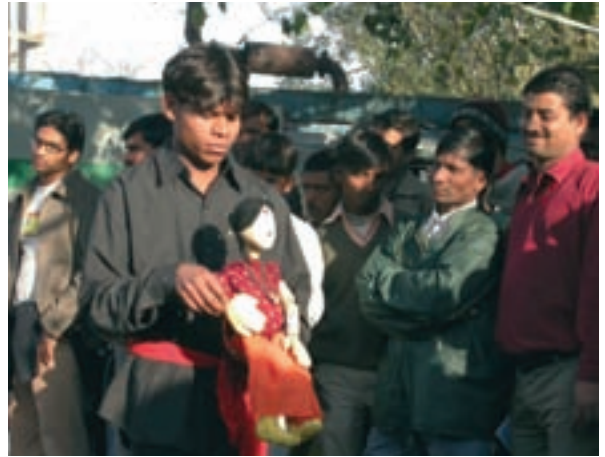
© The Ishara Puppet Theatre Trust

The project seeks to develop new partnerships and has responded to several requests already. It is now involved in the training of others in simple puppet making and performing for similar socio-educative programmes.