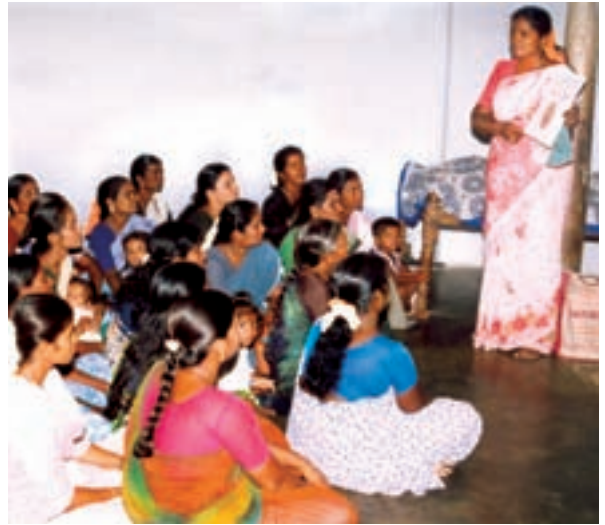
© TT Ranganathan Clinical Research Foundation

The project organizes poster exhibitions, develops street plays with young people to raise awareness in the community and encourages participants to arrange discussion workshops with their peers. It plants trees and encourages participants to share job announcements to show others how to enhance their livelihoods in a sustainable way.