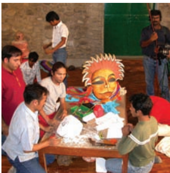
© The Ishara Puppet Theatre Trust

Plays are created to reach out to a wide range of audiences across the Delhi state and other parts of India. The plays are progressively developed through a series of workshops with the children and the guidance of both professional script writers