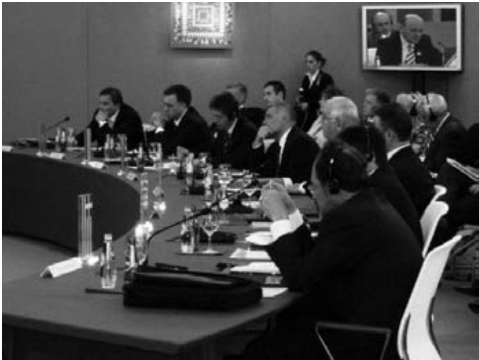
The Heads of State/Government at Opatija Regional Forum on Communication of Heritage