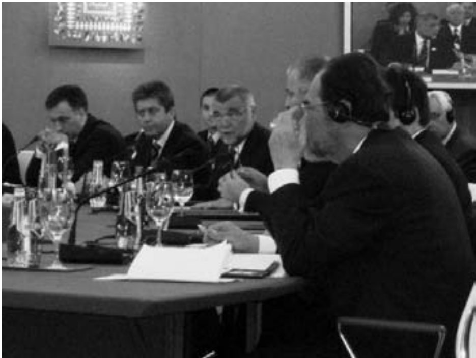
The Heads of State/Government at Opatija Regional Forum on Communication of Heritage