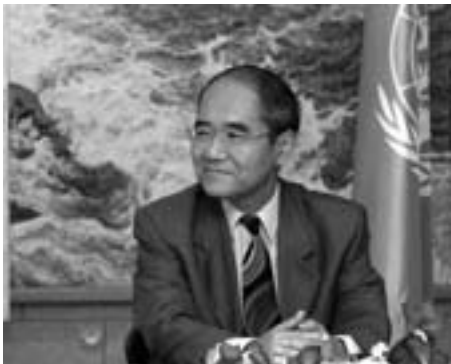
Koïchiro Matsuura Director-General of the United Nations Educational, Scientific and Cultural Organization

Effective and meaningful cooperation requires mutual understanding and genuine dialogue among all parties involved. UNESCO will not be found wanting in helping expand and deepen this process, in an effort to produce tangible results and provide guidance in the further development of policies that will benefit the countries of South East Europe.