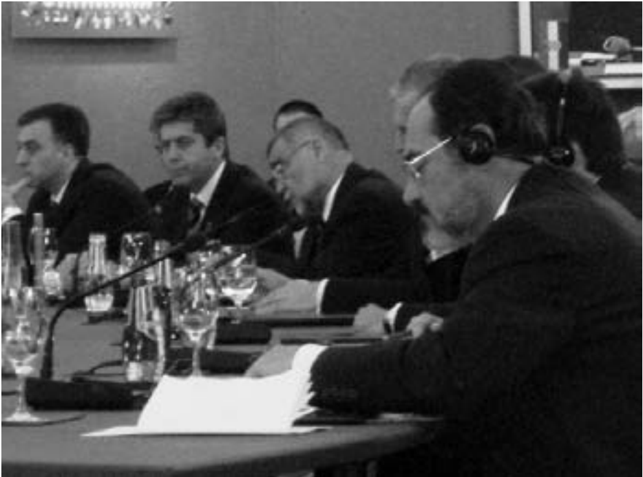
The Heads of State/Government at Opatija Regional Forum on Communication of Heritage