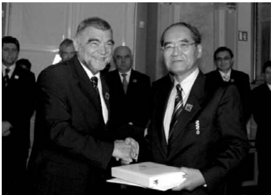
Stjepan Mesić, President of the Republic of Croatia, with Koïchiro Matsuura, Director-General of UNESCO