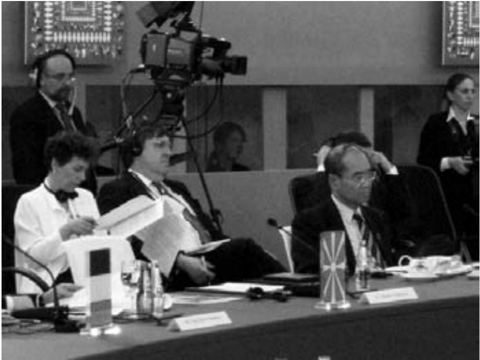
The Opatija Regional Forum on Communication of Heritage