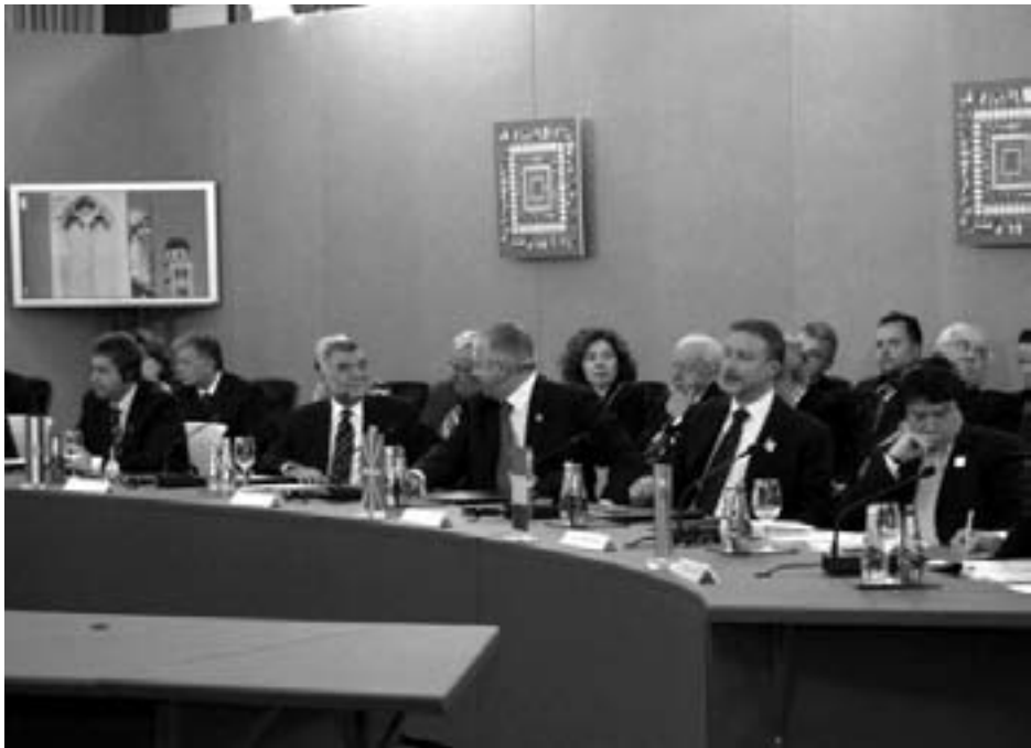
The Opatija Regional Forum on Communication of Heritage