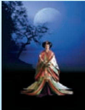
le jûni-hitoe